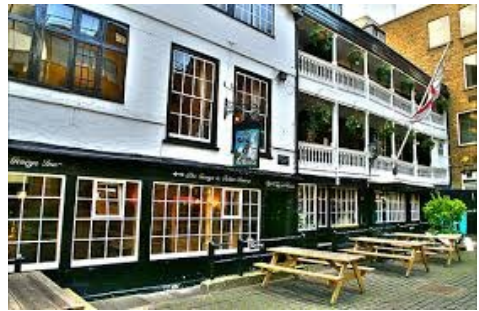
The George Inn

email: gillyvor@hotmail.com Confirmation will be by email where possible. If you do not give an email address please enclose a stamped addressed envelope. Thank you.