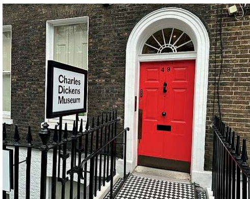
Entrance to the Charles Dickens Museum

The five-storey house opened as a museum 100 years ago on 9 June 1925. It holds the world's most important Dickens collection. It contains many mementos from Dickens's life and writings.