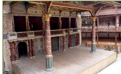
Stage of The Globe Theatre, Southwark

The bus journey takes about 10 minutes (5 stops) and we get off at Lavington Street. We turn left into Great Guildford Street and then right into Park